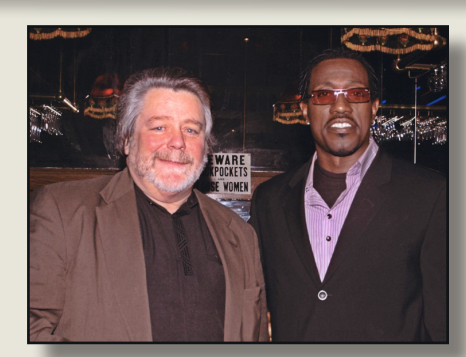
Dick With Wesely Snipes